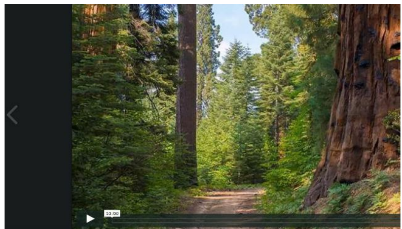
Giants in My Backyard: A Story of Land, People, and a Priceless Resource

For the fourth consecutive year, our office, in partnership with the California Historical Society and the State Historical Resources Commission, had the honor of presenting special California Historic Places awards at