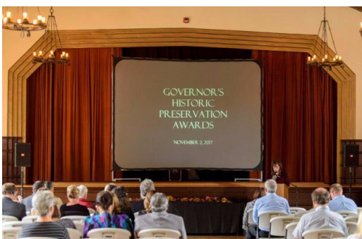
Image: The historic City Hall building in Alameda , one of California's certified local governments.

CLG staff and commissioners have the opportunity to receive scholarships to attend the 2019 Main Street Now Conference , taking place March 25-27 in Seattle, Washington. The National Park Service will award 23 scholarships to cover conference registration expenses (other expenses such as travel, lodging, etc., are not covered). Apply online . Application deadline: February 14, 2019. For questions or additional information, contact clg_info@nps.org .