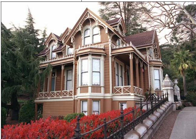
The Boyd Gatehouse currently houses the Marin History Museum, which began construction of a new facility in 2005.

City policy has been to protect and build upon the historic character that exists in the City. The City adopted a Historic Preservation Ordinance in 1978. The ordinance established guidelines regarding remodeling or demolishing historic buildings. The ordinance is implemented by the Design Review Board and Planning Commission. See Exhibit 24 for a list of historical landmarks in San Rafael.