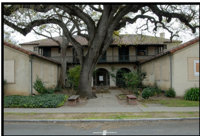
Photograph 42. Palo Alto Medical Clinic, Palo Alto, Santa Clara County, California

The roundhouse is constructed of brick with a ceiling of wooden beams, and contains 17 enclosed stalls,