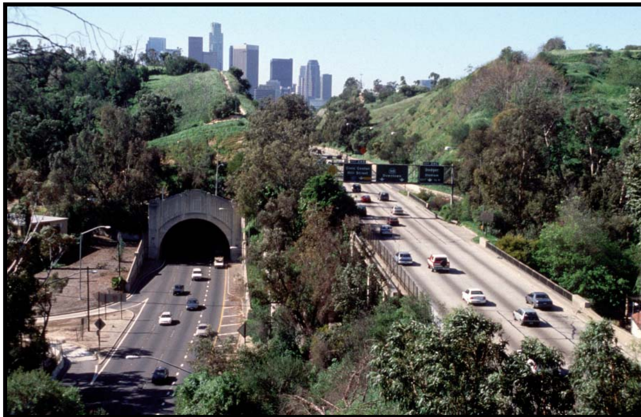
Photograph 20. Arroyo Seco Parkway, Los Angeles County, California

Parkway Historic District is a 6-lane, 8.21 mile limited-access roadway traveling in a southwesterly direction through the cities of Pasadena, South Pasadena, and Los Angeles, from East Glenarm Street, Pasadena to the Four Level Interchange in Los Angeles. The district has 45 total contributors, including grade separations, tunnels, bridges, overcrossings, pedestrian overpasses, pedestrian and equestrian undercrossings, the roadway itself, the Four Level Interchange, Arroyo Channel, and two buildings at the Arroyo Seco Maintenance Station. The district was constructed in three phases between 1938 and 1953. The Commission recommended the property for listing under Criteria A, B and C for its association with transportation planning, its principal engineer and political advocate Lloyd Aldrich, and bridge and tunnel architecture, for Criteria A and C at the state level of significance and for Criterion B at the local level of significance.