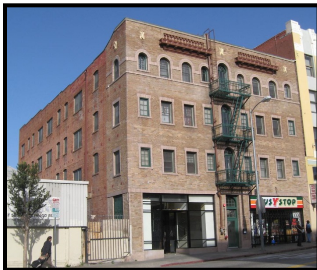
Photograph 22. Bricker Building, Los Angeles, Los Angeles County, California