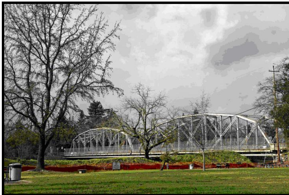
Photograph 45. Healdsburg Memorial Bridge, Healdsburg, Sonoma County, California

A striking example of a Pennsylvania through-truss type bridge, the Healdsburg Memorial Bridge was constructed in 1921 and spans the Russian River in the Sonoma County town of Healdsburg. As the first steel bridge constructed across the Russian River the bridge served as a vital link on the portion of Highway 101 that stretches