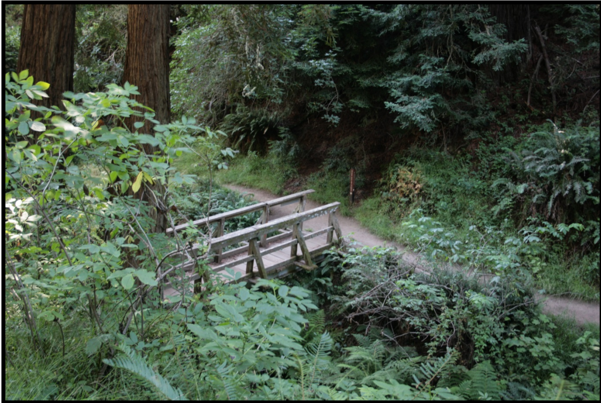
Photograph 26. Dipsea Trail, Marin County, California

The Dipsea Trail is a popular hiking and running trail and the route of the annual Dipsea Race, held since 1905. The trail begins in the city of Mill Valley and ends at Stinson Beach on the Pacific Ocean. Predominantly a narrow foot trail, short portions of the race and trail route include paved streets, rural roads, and stairways. It features torturous uphill grades and dangerous descents, and traverses four governmental jurisdictions: the City of Mill Valley; unincorporated areas of Marin County; National Park Service lands within Muir Woods National Monument and its parent, Golden Gate National Recreation Area; and lands within Mt. Tamalpais State Park, a unit of the California State Parks system. The property was listed under Criterion A at the local level for its association with the social and recreational development of competitive long distance foot racing in the San Francisco Bay Area. As a popular early twentieth century hiking route and the location of the Dipsea Race, the Dipsea Trail influenced the Bay Area in the creation of parks, preservation of open space, and proliferation of running competitions and similar community events.