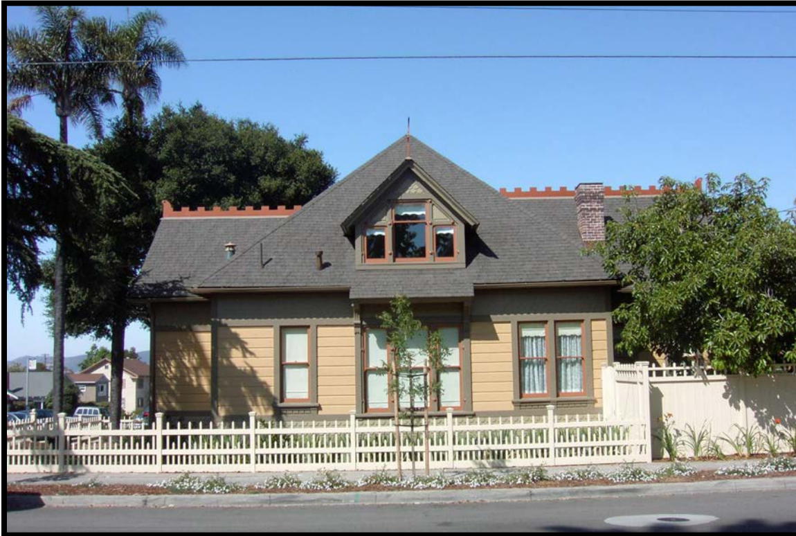
Photograph 40. William Shipsey House, San Luis Obispo, San Luis Obispo County, California