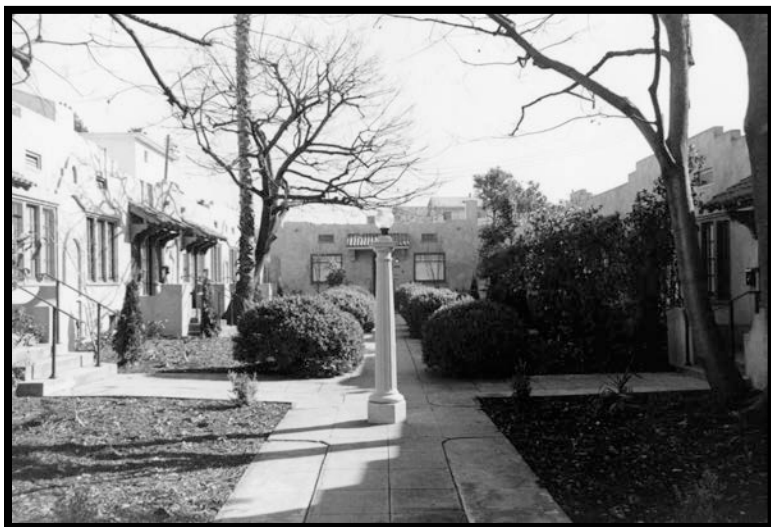
Photograph 16. 1516 North Serrano Avenue, Los Angeles, Los Angeles County, California

Preservation Certification Application for all four properties. Each property was listed individually at the local level under Criterion A for its association with the development of the Hollywood area of Los Angeles during the 1920s, and under Criterion C because each property embodies the distinctive characteristics of the bungalow court, a building type characteristic of residential development in Hollywood during the early decades of the twentieth century.