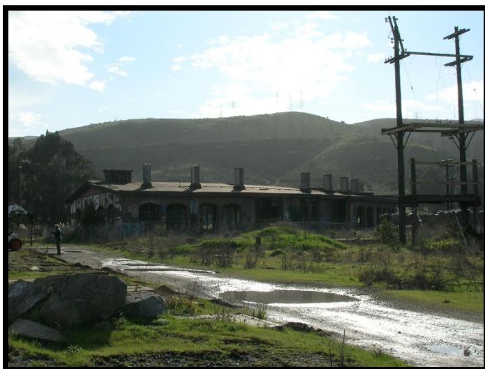
Photograph 41. Southern Pacific Bayshore Roundhouse, Brisbane, San Mateo County, California

numbered clockwise from 24 to 40. The roof is radially gabled, clad with pitch and gravel. The building has arched wooden windows. A firewall is located between stalls 32 and 33, and the exterior wall adjacent to stall 24 is also a firewall. The whisker tracks are indicated by light poles at the end of each track. In the center of the roundhouse's radius is a circular concrete turntable pit, 110 feet wide. The Bayshore Roundhouse was listed under Criterion C as an example of vernacular railroad architecture. Roundhouses were used for the storage and minor maintenance of steam locomotives and typically used in conjunction with a turntable, which was used to turn locomotives and allow access to the roundhouse. The facility was modified several times over the period of its use, including expansion of the turntable pit from 80 to 110 feet and minor modifications to the building's interior. The building suffered a fire in 2001 that destroyed the roof and wooden windows between stalls 24 and 32 and was stopped by the brick firewall. The brick, concrete and metal portions of the building remain intact. There is no longer a turntable in the pit, and the pit itself is intact.