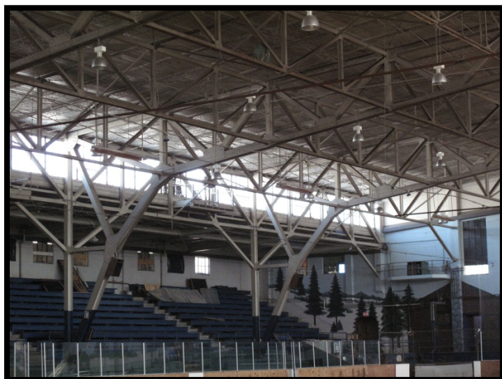
Photograph 10. Berkeley Iceland, Berkeley, Alameda County, California

Berkeley Iceland is an enclosed 58,920-square-foot ice rink constructed in the Moderne style in 1940. Founded as a community-funded facility through a local subscription drive, unusual in an era of Works Progress Administration or government bond backing for community facilities, Iceland is the San Francisco Bay Area's oldest surviving ice rink, was host to three US National Figure Skating Championships, and served as practice ice for generations of skaters from recreational enthusiasts to Olympian gold medalists. Berkeley