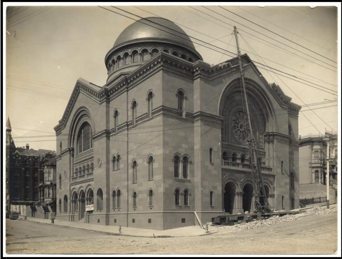
Photograph 1. Temple Sherith Israel, San Francisco, San Francisco County, California