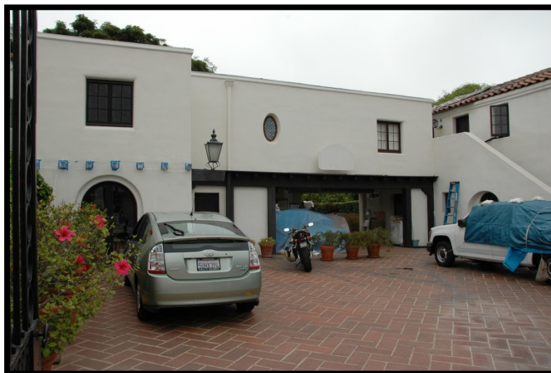
Photograph 21. Bradbury House, Los Angeles, Los Angeles County, California

The Bradbury House is a two-story residence in the Spanish Colonial Revival style,