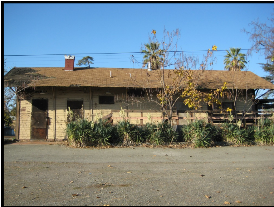
Photograph 3. Live Oak Railroad Depot, Live Oak, Sutter County, California.

The historical archaeology position on the Commission was open in 2010.