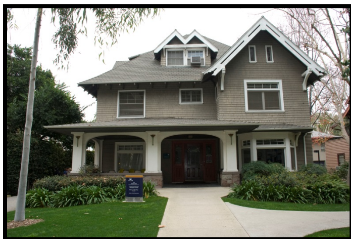
Photograph 24. Ford Place, Pasadena, Los Angeles County, California

The California Club is an eight-story Renaissance Revival building designed by Robert D. Farquhar, located in downtown Los Angeles. The building has a broad rectangular base and two setbacks, Roman brick cladding, steel casement windows and transoms, and ornamentation throughout based on Italian Renaissance models. Architectural details include a stone entryway with Classical entablature, stonework on window surrounds, belt courses and cornice, and the massing, wherein major