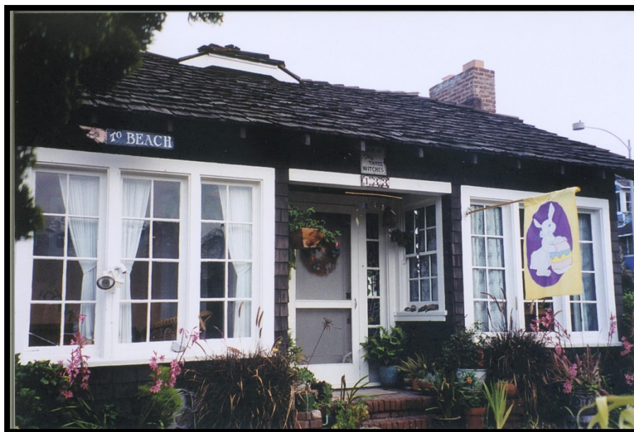
Photograph 48. Bailey House, Manhattan Beach, Los Angeles County, California

facilities such as Jet Propulsion Laboratory and the California Institute of Technology in Pasadena, Moffett Field in Mountain View, and Aerojet in Sacramento. These institutions helped define twentieth century California as a world leader in Aerospace technology. The objects are significant within the context of human exploration of space and within the context of the Cold War between the United States and Russia. The Commission listed the Objects Associated with Apollo 11 under Criteria 1, 2, 3, and 4 at the national level of significance.