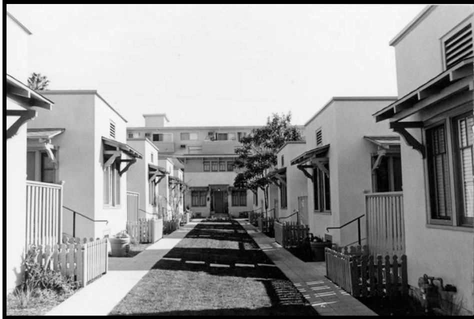
Photograph 18. 1554 North Serrano Avenue, Los Angeles, Los Angeles County, California

1554 North Serrano Avenue is a thirteen-unit bungalow court constructed in 1921. Designed in the Spanish Colonial Revival style by architect A.B. Crist, the site is composed of five attached bungalows on each side of a central courtyard, with a two-story three-unit building at the rear.