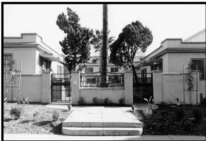
Photograph 17. 1544 North Serrano Avenue, Los Angeles, Los Angeles County, California

1544 North Serrano Avenue is an eight-unit bungalow court constructed in 1925. Designed in the Spanish Colonial Revival style by architect Postell (first name unknown), the site is composed of three detached bungalows on each side of a central courtyard, with a two-story two-unit building at the rear.