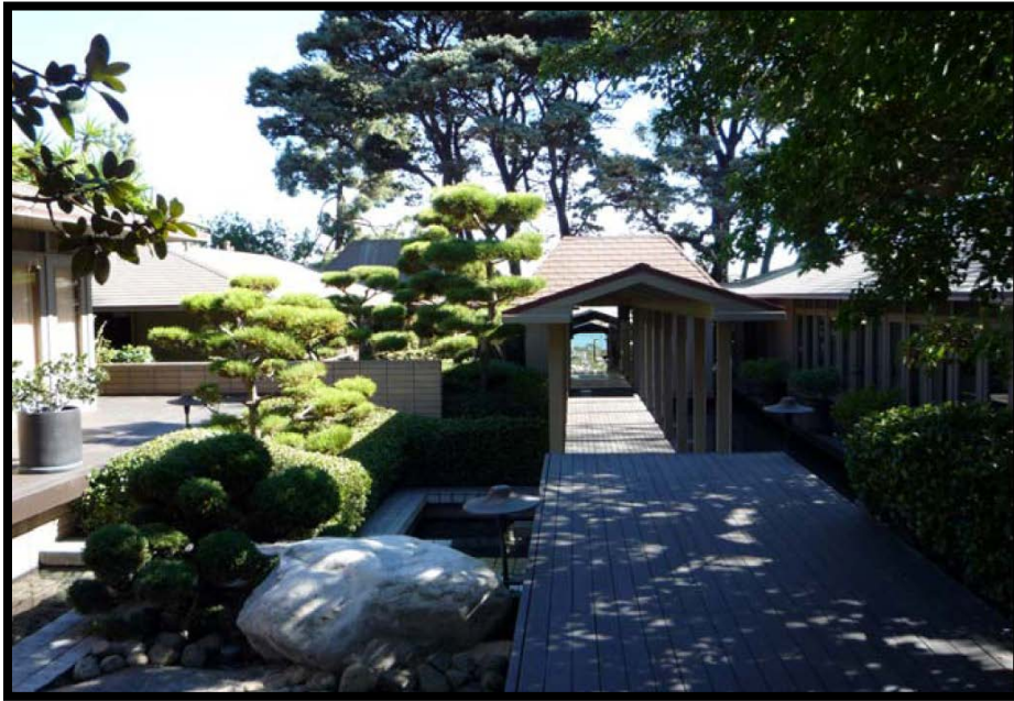
Photograph 49. Robert O. Peterson-Russell Forester Residence, San Diego, San Diego County, California

part of this beachfront community. The Commission listed the property under Criterion 3 for its distinctive characteristics of the Craftsman style as expressed in its era and region. Elements of the building like the casement windows and lack of a projecting front porch differ from strict Craftsman styles and represent the builder's response to a small, unique site and the climate of southern California.