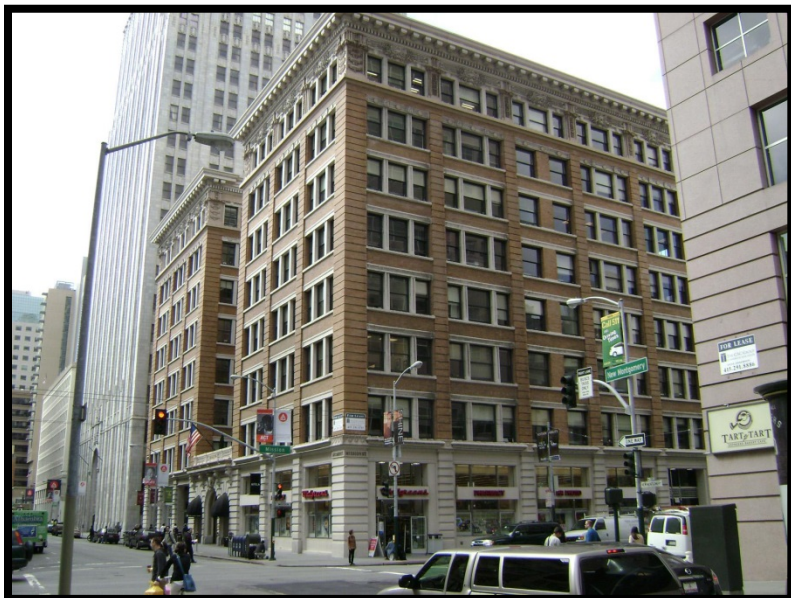
Photograph 35. Rialto Building, San Francisco, San Francisco County, California

Initially constructed during the building boom in San Francisco at the turn of the twentieth century, the Rialto Building featured a Chicago-inspired open plan and light courts and was designed by the San Francisco-based architecture firm of Meyer & O'Brien. This commercial office building became symbolic of reconstruction efforts after the Earthquake and Fire of 1906 when the interior was gutted by fire and its exterior shell survived. Prominently located at a major intersection in the newly expanded Financial District, the reconstruction of the building was encouraged by the City of San Francisco. Architects Bliss & Faville reconstructed the building in 1910. When the work on the Rialto Building was complete, the venture was heralded as a transformative project that restored faith in the City. The reconstructed building, which retained its original 1902 exterior, was unique in a cityscape now dominated by modern buildings and skyscrapers constructed after the Earthquake and Fire to replace those buildings lost by the disaster. The Commission recommended the Rialto Building for listing under Criterion A for Community Planning and Development and under Criterion C as an example of a unique architectural type.