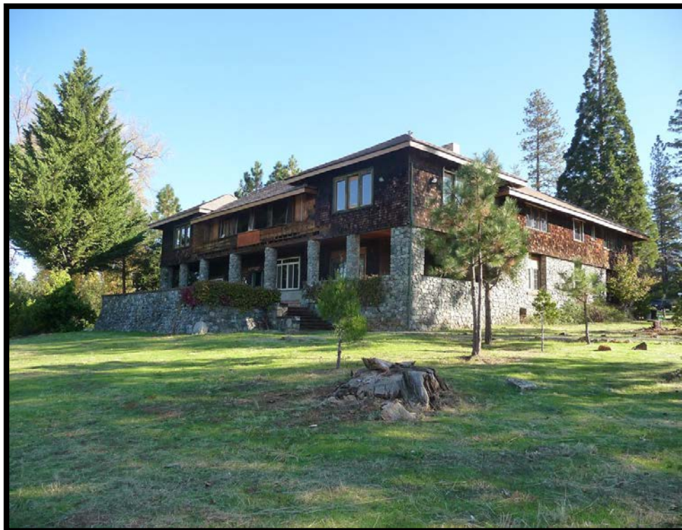
Photograph 28. North Star House, Grass Valley, Nevada County, California

The North Star House in Grass Valley is an 11,000-square-foot, two story, Craftsman building located on a crest of a hill, oriented west with a pine-studded view of the Sacramento Valley below. Designed in 1905 by architect Julia Morgan, the residence is U-shaped in plan, with an entry courtyard on the east side and a