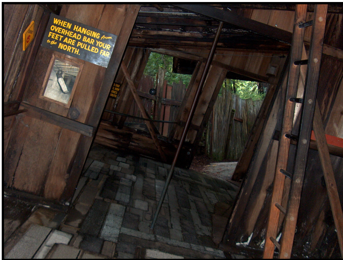
Photograph 51. Confusion Hill, Mendocino County, California

Confusion Hill , a roadside amusement park that has been in continuous operation since opening in 1949, is located on a 13-acre parcel east of SR 101, 3.5 miles south of Piercy, California. It is the only example of a gravity house theme park, a distinctive type of roadside commercial architecture developed in the post World War II era, in Mendocino County. The parcel is heavily forested land, largely covered with mature and old growth redwood trees. Confusion Hill consists of four venues, or attractions: the Gravity House, snack and gift/curio shop, mountain train ride, and the redwood shoe house. Other contributing resources constructed between 1949 and 1955 include the manager's cottage, restrooms, a ticket booth, and extensive landscaping features that include fencing, walkways, paths, and signage. A massive totem pole, and several other more recent folk art redwood carvings, including a "pointing hand," a giant panda bear, and the "chipalopes," make-believe chipmunks with horns, were created in the 1990s. A residence, built in 1959 sits atop the "hill" near a modern barn. Despite alterations to the site, Confusion Hill retains a high degree of integrity. The Commission listed Confusion Hill as a California Point of Historical Interest under Criteria 1 and 3 for important associations with the themes of tourism, recreation, roadside theme parks, and rustic vernacular architecture along the Redwood Highway.