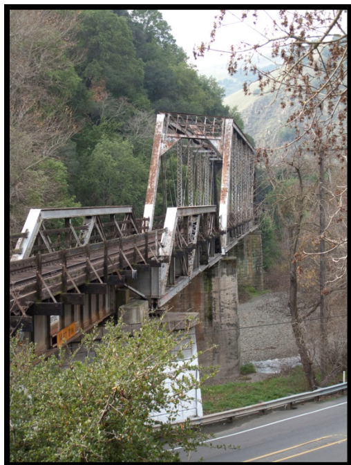
Photograph 11. Niles Canyon Transcontinental Railroad Historic District, Alameda County, California

Iceland was determined eligible for listing under Criterion A at the local level for its association with the development of entertainment and recreation during the peak popularity of ice rink sports 1920-1975, and in particular, a golden age of ice skating during the 1930s and 40s, as well as under Criterion C at the local level because it embodies the distinctive characteristics of Moderne architecture, also known as Streamline or Streamlined Moderne. The building satisfies Criteria Consideration G: Properties That Have Achieved Significance Within the Past Fifty Years for its role in the development of community recreation, and association with ice skaters of national and international renown through 1966.