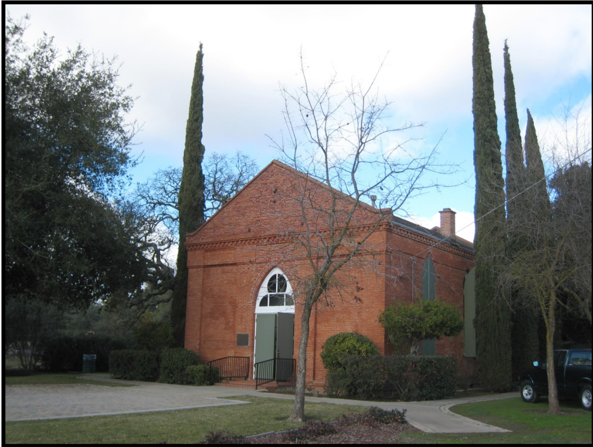
Photograph 39. Harmony Grove Church, Lockeford, San Joaquin County, California

Harmony Grove Church in Lockeford was originally constructed as a Greek Revival Style church from 1859-1861, remodeled in 1868 in the Gothic Revival Style. The one-story brick building has a medium-pitched front gable roof, arched Gothic Revival windows, and a central Gothic arched entry on the primary façade. Its remodeled appearance combines Greek Revival elements with Gothic Revival details. Abandoned in 1918, the church was partially gutted in 1965 in anticipation of demolition, and restored in 1973. The property is recommended for listing under Criteria A and C at the local level of significance, for its role in the early settlement of California's central valley and its embodiment of the characteristics of both Greek and Gothic Revival styles, and addresses the requirements of Criteria Consideration A. Named for the town of New Harmony, Indiana, and the oak grove where it was erected, the church was dedicated in 1861. In addition to religious services, the building was used by the community for meetings and public school exercises. The building's period of significance is 1859-1918. Extensive research and documentation by Sacramento State graduate student Gary Gordon became the basis for a restoration project completed in 1973.