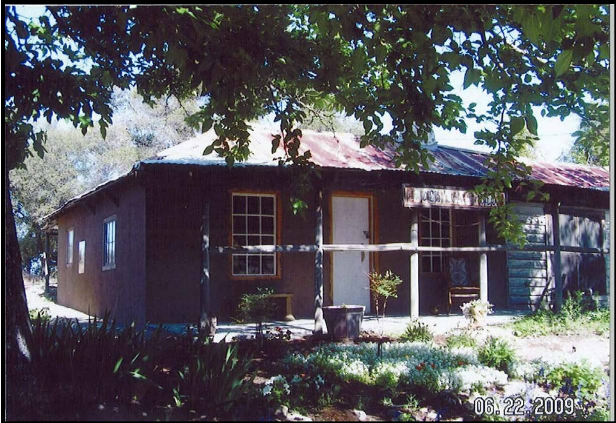
Photograph 50. Willow Glen Stage Stop, Coarsegold, Madera County

Willow Glen Stage Stop , a stagecoach/freight wagon stop built in approximately 1877, is one of a handful of surviving wagon stops, and the only surviving stage stop that is still standing and open to the public, on the southern wagon trail to Yosemite. It is also the only packed adobe building in Madera County or the surrounding region. Located in Coarsegold, on what is now State Highway Route 41, the stage stop consists of two buildings, an 1870s era packed adobe building, a second room of packed adobe added in 1898, and a newer wood addition constructed in 1949. This addition replaced an earlier two-story structure. The site also includes the Picayune School, a California Register-listed building, and a barn, part of a complex used as a museum, research library and interpretive center. The building was in use as a stage stop from the completion of the road in 1877 until the completion of Highway 41, on a different alignment, in 1939. The Commission listed the Willow Glen Stage Stop as a California Point of Historical Interest under Criteria 1 and 3 for its association with the theme of early California stagecoach transportation and the architectural use of packed adobe, an exceptionally rare technique in the state of California.