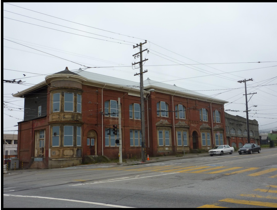
Photograph 34. Geneva Office Building and Powerhouse, San Francisco, San Francisco County, California

The Geneva Office Building and Powerhouse is a pair of attached buildings located at the intersection of Geneva and San Jose Avenues in San Francisco. The Office Building, constructed in 1901, is a two-story brick structure with a corrugated metal hipped roof, with Romanesque features and a Queen Anne corner turret. The Powerhouse is a one-and-a-half story rectangular brick structure with a gable