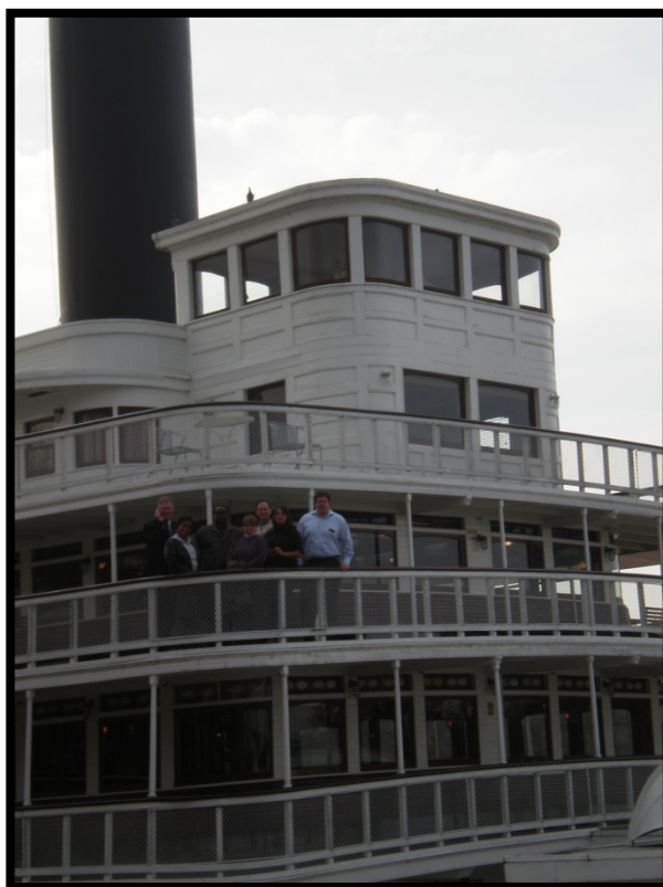
Photograph 5. Commissioners and staff on board the Delta King riverboat, Sacramento, California.

The April 29, 2010 workshop was held at the Governor's Mansion State Historic Park. After lunch the Commission toured the Mansion, including special access to the third floor and tower closed to the public during an extensive restoration project. Originally designated museum exhibit space, the discovery of original finishes and design work led the park to begin rehabilitation and restoration to present the third floor as it would have been used, in keeping with the rest of the Mansion. The Sacramento Old City Association hosted the post-workshop reception at the Mansion.