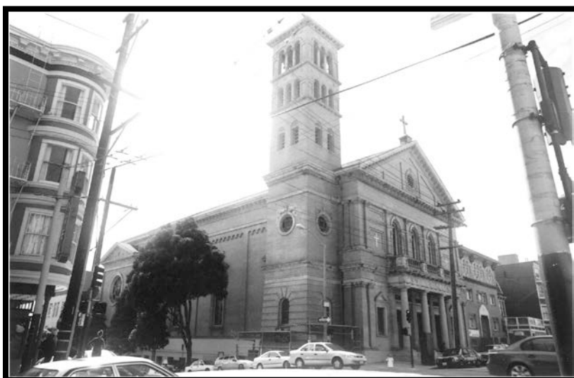
Photograph 36. Sacred Heart Church, San Francisco, San Francisco County, California

Initially constructed during the building boom in San Francisco at the turn of the twentieth century, the Rialto Building featured a Chicago-inspired open plan and light courts and was designed by the San Francisco-based architecture firm of Meyer & O'Brien. This commercial office building became symbolic of reconstruction efforts after the Earthquake and Fire of 1906 when the interior was gutted by fire and its exterior shell survived. Prominently located at a major intersection in the newly expanded Financial District, the reconstruction of the building was encouraged by the City of San Francisco. Architects Bliss & Faville reconstructed the building in 1910. When the work on the Rialto Building was complete, the venture was heralded as a transformative project that restored faith in the City. The reconstructed building, which retained its original 1902 exterior, was unique in a cityscape now dominated by modern buildings and skyscrapers constructed after the Earthquake and Fire to replace those buildings lost by the disaster. The Commission recommended the Rialto Building for listing under Criterion A for Community Planning and Development and under Criterion C as an example of a unique architectural type.