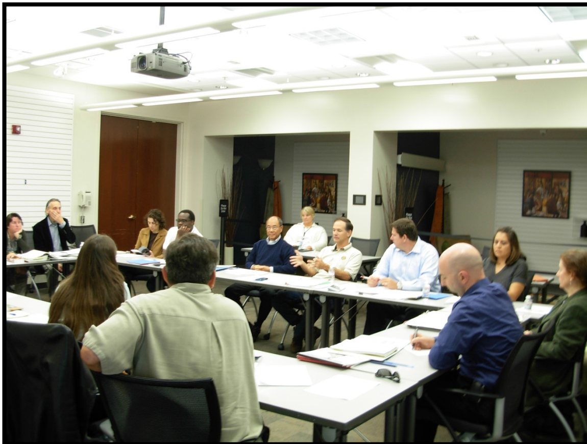
Photograph 4. Commissioners and Staff held the November 2010 workshop at the SMUD Customer Service Center, Sacramento, California.