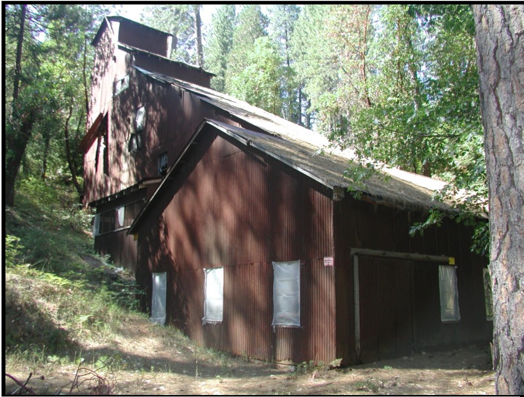
Photograph 9. Davis Mill, Nevada County, California.

The Commission heard and recommended for listing thirty-seven National Register of Historic Places nominations, including two Amendments and three Determinations of Eligibility; approved three properties for listing on the California Register of Historical Resources; and approved for designation two California Points of Historical Interest. No California Historical Landmark nominations were submitted to the Commission in 2010. The following pages contain a summary of each registration program and the nominations heard by the Commission in 2010.