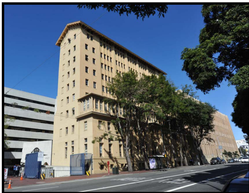
Photograph 37. San Francisco Juvenile Court and Detention Home, San Francisco, San Francisco County, California

Welsh. The property embodies the distinctive characteristics of the Romanesque Revival style, including a gable-roofed façade, gabled nave and transept arms, towering campanile with arcaded openings and pyramidal roof, eave-height arcaded corbel table, decorative stringcourses, and the pedimented portico supported by Tuscan order columns. The marble altars of Sacred Heart Church were designed by artist Attilio Moretti, who worked in marble, stained glass, and painting. He is probably best known for his elaborate frescoes in Temple Sherith Israel in San Francisco. As a building significant for its architecture, it meets the requirements of Criteria Consideration A regarding religious properties.