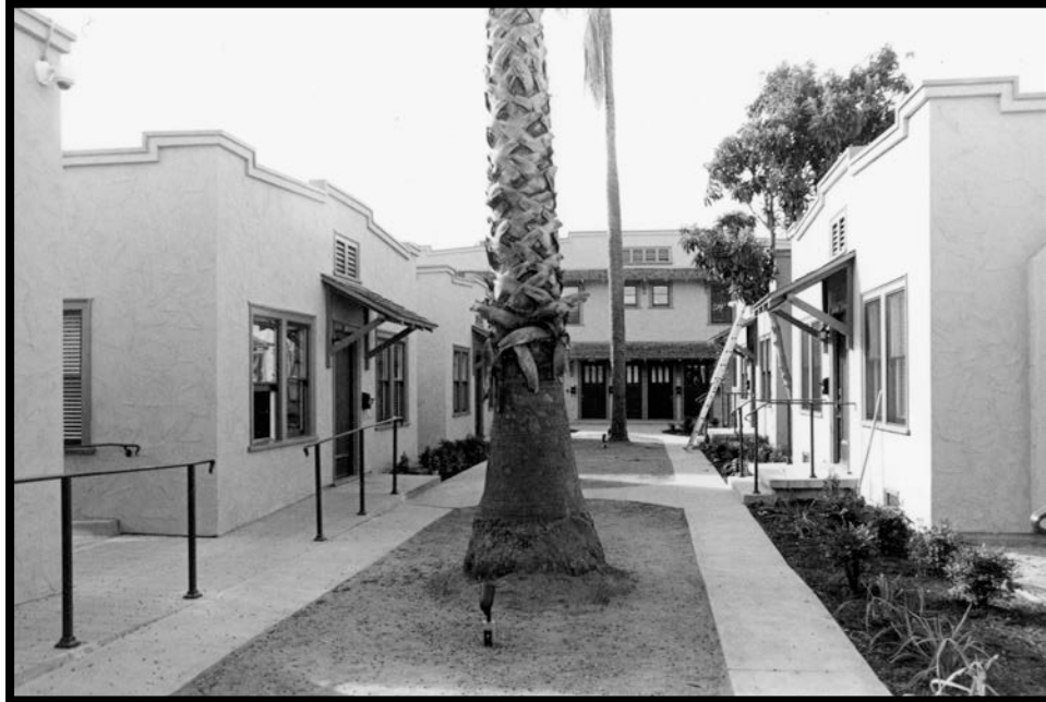
Photograph 19. 1721 North Kingsley Drive, Los Angeles, Los Angeles County, California