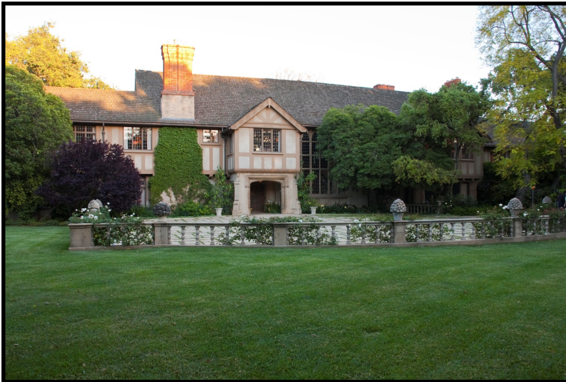
Photograph 25. Emery Estate, San Marino, Los Angeles County, California

the property into 75x200 foot lots with 50-foot setbacks. The residential properties of the district were all constructed in a relatively short period of time; seven of the surviving ten between 1903 and 1906, with the remaining three constructed by 1916. Properties include Craftsman, Prairie, Shingle, and various revival styles. In addition to the buildings, Ford Place includes the surviving mature Canary Island Date Palms on Ford Place and the 100 block of North Oakland. Ford Place was listed under Criterion A at the local level of significance for its association with the early development of Pasadena as one of the city's earliest planned residential neighborhoods, and under Criterion C at the local level for the high quality examples of period architectural styles constructed by master architects including Sylvanus B. Marston, Frederick Roehrig, Charles F. Driscoll, and George Washington Maher.