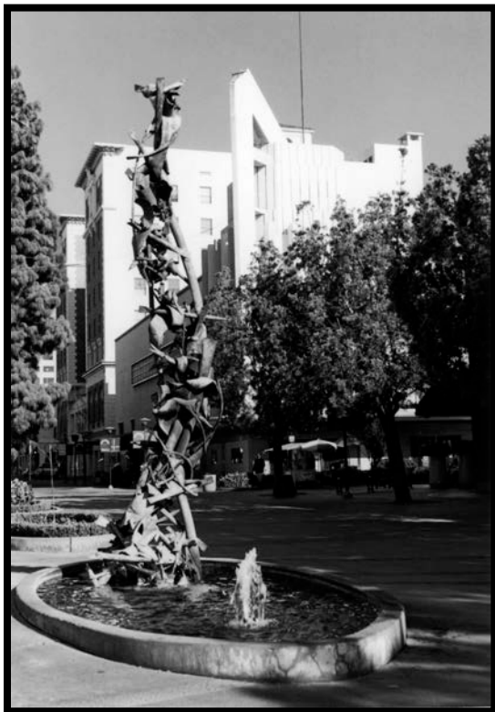
Photograph 14. Fulton Mall, Fresno, Fresno County, California

The Fulton Mall in Fresno was determined eligible for listing at the state and local levels of significance under Criteria A and C, in the areas of Landscape Architecture, Community Planning and Development, Recreation/Entertainment, and Social History. A collaborative effort of the respected urban planner Victor Gruen and celebrated twentieth-century landscape architect Garrett Eckbo, the Fulton Mall was completed in 1964 during the early, defining era of the discipline known as modern urban design and planning. A clear expression of many of the evolving theories of contemporary landscape design, including the removal of vehicular traffic from downtown areas and the creation of pedestrian-friendly urban spaces, the Fulton Mall represents a well preserved example of the work of master landscape architect, Garrett Eckbo, whose career as both teacher and practitioner helped transform the field of post-war landscape architecture. The Fulton Mall is