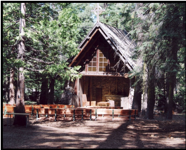
Photograph 30. Chapel of the Transfiguration, Placer County, California

Photograph 29. El Toyon, Auburn, Placer County, California different owners, the external structure has retained historic integrity. El Toyon was listed at the local level under Criterion C as an excellent local example of the Shingle style of architecture. Character defining features are the distinctive running coursed wood shingles sheathing and wrapped corner edges; two double-storied turrets; bays; a moderately pitched, complex roofline emphasizing horizontal lines; simple ornamentation detailing exhibited in the classic columns, unadorned boxed eave, and flat frieze trim. While other shingle-cover houses exist in Auburn, they are for the most part bungalows constructed in a later period. El Toyon has the distinction of being the most significant example of the Shingle Style in Auburn, is surrounded by estate grounds, and exhibits the essential elements of the style.