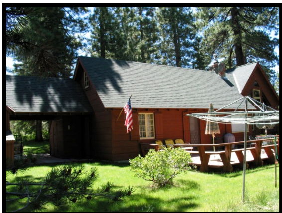
Photograph 13. Tahoe Meadows Historic District, Tahoe Meadows, El Dorado County, California

Tahoe Meadows Historic District is a 106 acre area incorporated as a non-profit association of property owners in 1925. Originally listed on the National Register in 1990, the district consists of rural cabins on privately owned lots with open space preserves. The district was amended in 1992. The current amendment extends the period of significance to 1954 via expanded architectural context and reflects the loss of several contributors since 1990, adding nine new buildings and removing four from the district. The original nomination ended the period of significance in 1941 to reflect the temporary end of new building construction during World