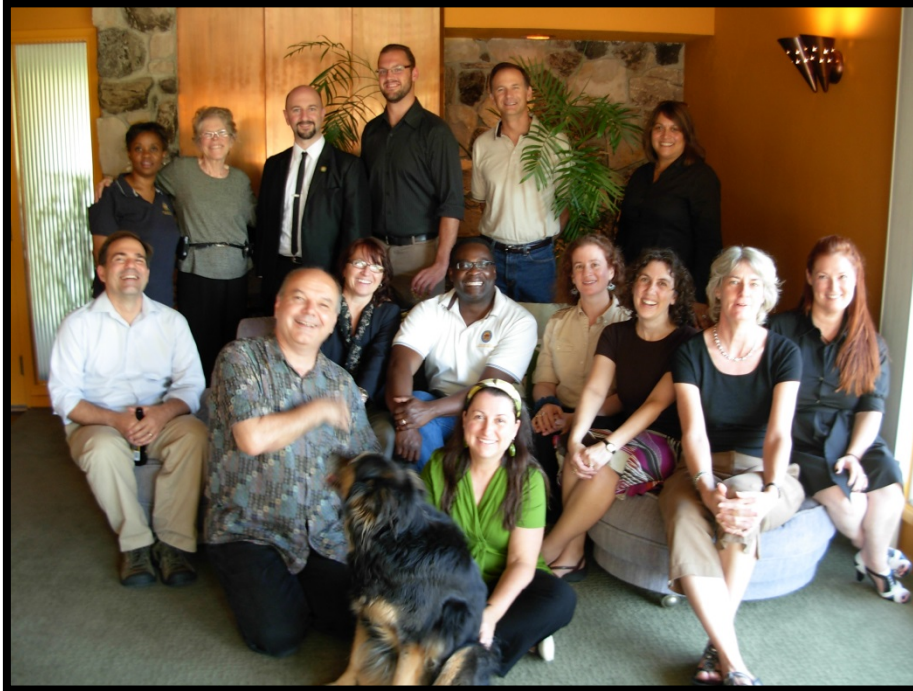
Photograph 7. Commissioners and staff at Eichler-designed home in South Land Park, Sacramento, California.