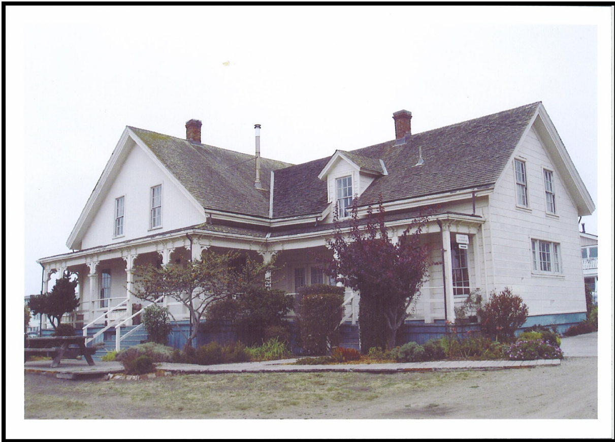
Photograph 27. Jerome B. Ford House, Mendocino, Mendocino County, California