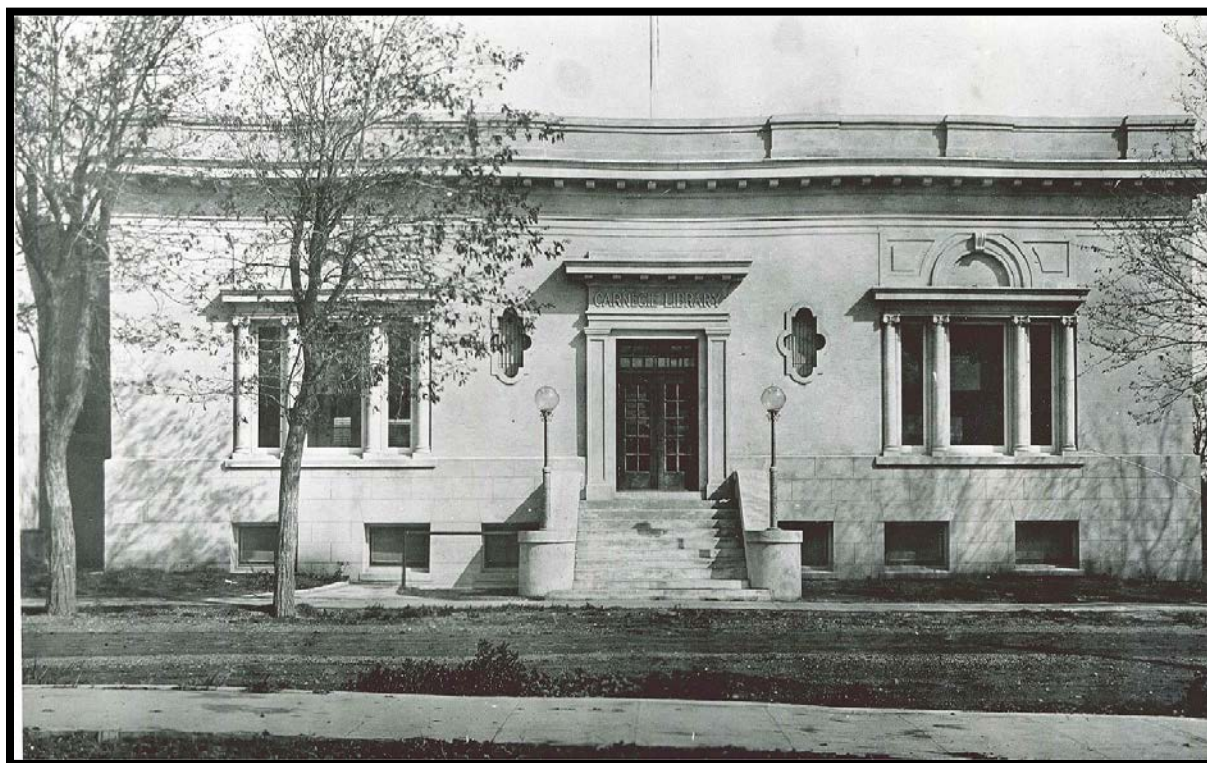
Photograph 44. Dixon Carnegie Library, Dixon, Solano County, California

The Dixon Carnegie Library is an approximately 2,300 square foot building designed in a Classical Revival style, located near a historic residential district that once housed Dixon citizens influential in establishing the Carnegie Library. The library is within walking distance to local schools and downtown businesses. It retains its historic function as a library facility and social meeting place to the present day, significant for the role it has played in the educational, cultural, and social development of the eastern Solano County town of Dixon. Constructed in 1912 when Dixon's population was only 1,000 persons, the library speaks to the aspirations and forward-thinking of the town's early leaders. Recommended by the Commission for listing under Criterion A at the local level, the Dixon Carnegie Library has been pivotal to the progress of education and culture in the social history of Dixon. It was the first building in the area dedicated to the purpose of free public library use, and was the first library built using Carnegie grant money in Solano County.