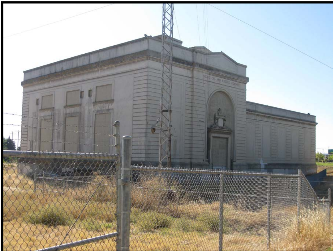
Photograph 32. PG&E Powerhouse, Sacramento, Sacramento County, California