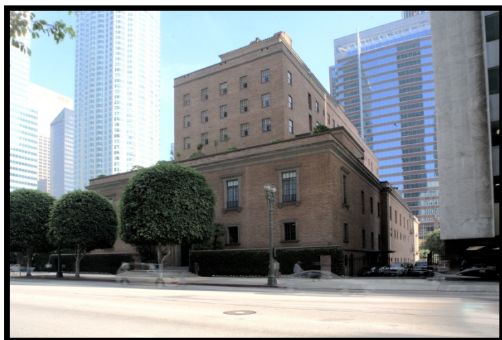
Photograph 23. California Club, Los Angeles, Los Angeles County, California

evolving physical form occurred in the city during an intense period of development that lasted from 1924 to 1929 and was brought about in large part by the emerging film industry. The Bricker Building embodies these profound changes to the built environment that occurred in 1920s Hollywood.