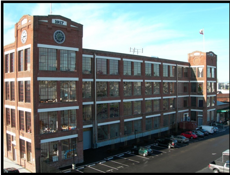
Photograph 12. California Cotton Mills Co. Factory, Oakland, Alameda County, California

railroad construction by Chinese immigrants, the district consists of 11.6 miles of right-of-way, including track, ties, signals, bridges, culverts and telegraph and telephone poles. Superseded in importance by a more direct route via the Carquinez Strait, this district's role as a local route meant that the frequent rebuilding common on main lines was less necessary. The Niles Canyon district maintains most of the original railroad's 1860s alignment, and has retained a high degree of integrity.