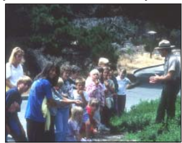
Be receptive to questions and discussion.

Be open to questions and discussion, especially when in transit between stops, but do not let one person monopolize your attention. Include others in the conversation, especially if it relates to the theme. If a particular point is relevant to the group, you should brief everyone at the next stop. Remember, it is very wise to clearly repeat the question asked by a visitor. Not only does this let everyone else know what question you are answering, it also