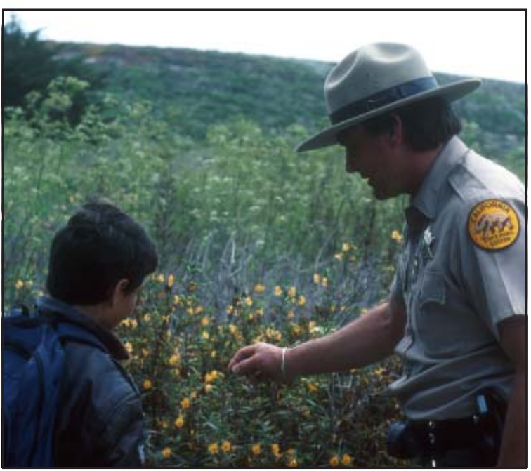
Explaining the rules and the reasons.

Build your kit bag of tools we discussed in Module 6-Talks. Use the mirror you carry in your kit bag to show the audience the underside of a mushroom. Individuals can view the gills without disturbing the plant. Handheld items and props really help illustrate your point in an ethical manner. Do not fail to use them.