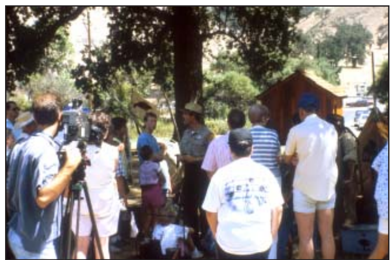
Large groups require special organization.

When group size increases, the time needed to organize the group at each stop, the transit time between stops, and the time spent clarifying issues and answering questions also increases. Since you told your audience that the walk would last a certain length of time, and the pace is generally dependent on the slowest person, your options for keeping on schedule are limited. Reducing the time spent at each stop, eliminating a stop (or stops) entirely, or a