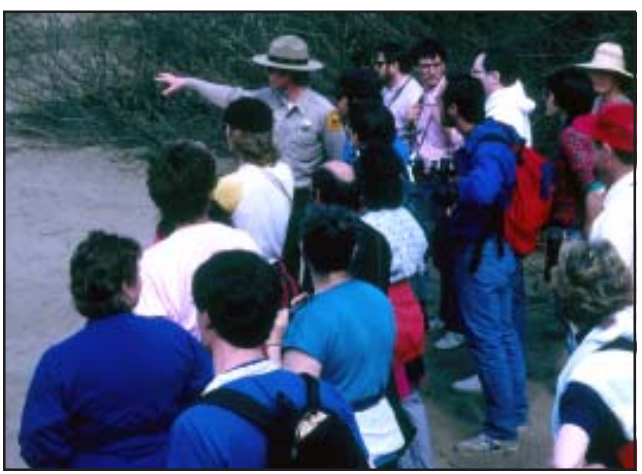
Stay in front of the group and be the leader.

The introduction of your theme could be delivered at either the staging area or this first stop. If the staging area is a busy location with distractions and other traffic, then introduce the topic but wait until the first stop to divulge your theme. Your theme is where you plant the seeds of discovery and anticipation. As we discussed in Module 5-Programs the theme is the "big picture" message, the "So what?" (Ham, 1992).