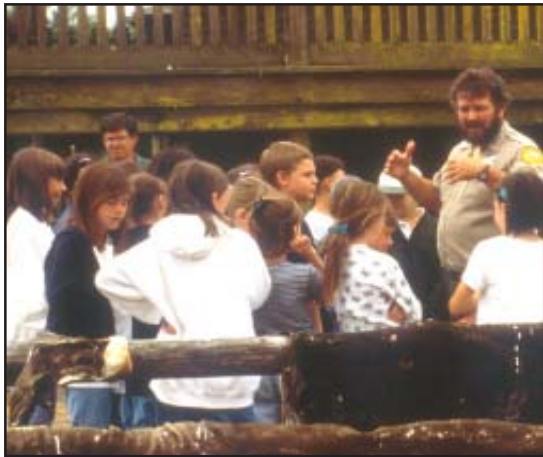
Walks incorporate a variety of experiences.

Facility walks allow the interpreter to make connections between the specific location, the broader issues, the historical context, and the visitors' own experiences.